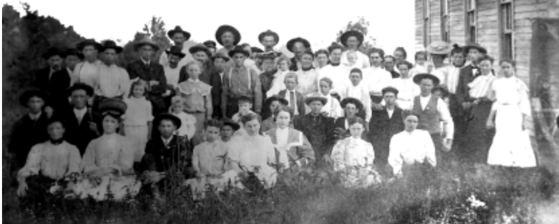
Gathering at the Riddle Church which included some of the Ballard Family.