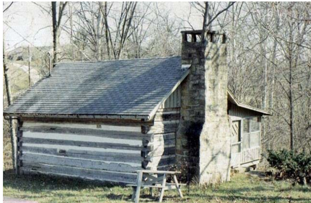
Thomas Stroud Cabin