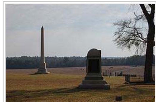
Some of the monuments at Andersonville.