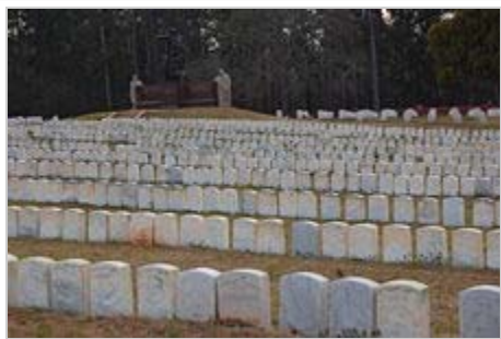
Andersonville National Cemetery

Unfortunately for Wirz, President Abraham Lincoln had recently been assassinated, so the political environment was not sympathetic. Wirz was found guilty of murder and was sentenced to death. On November 10, 1865 he was hanged. Wirz was the only Confederate official to be tried and convicted of war crimes resulting from the Civil War. The revelation of the sufferings of the prisoners was one of the factors that shaped public opinion in the Northern states regarding the South after the close of the Civil War.