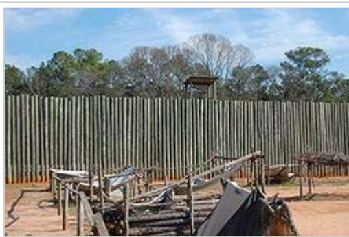
Reconstruction of part of the stockade wall.

The Andersonville prison , officially known as Camp Sumter , was the largest Confederate military prison during the American Civil War. The site of the prison is now Andersonville National Historic Site in Andersonville, Georgia. Most of the site actually lies in extreme southwestern Macon County, adjacent to the east side of Andersonville. It includes the site of the Civil War prison, the Andersonville National Cemetery, and the National Prisoner of War Museum. In all, 12,913 of the approximately 45,000 Union prisoners died there because of starvation, malnutrition, diarrhea, and disease.