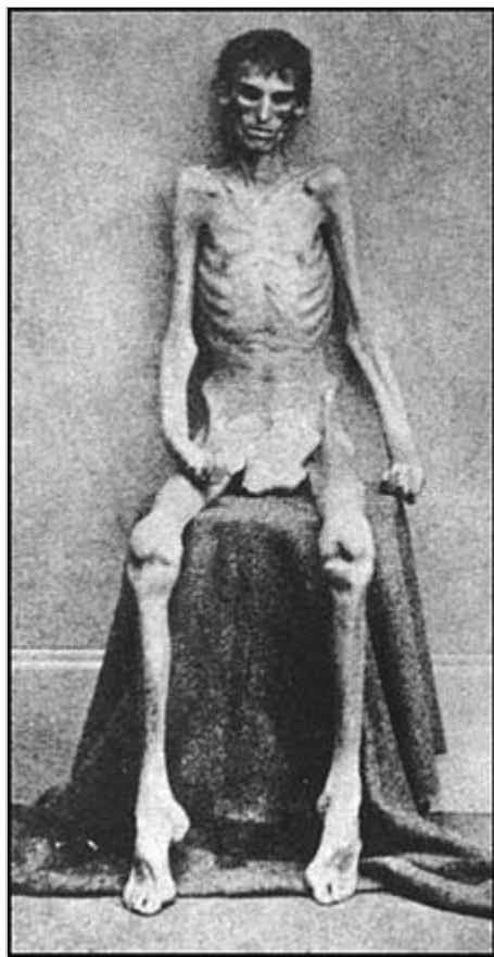
A Union soldier who survived.

In the autumn of 1864, after the capture of Atlanta, all the prisoners who could be moved were sent to Millen, Georgia, and Florence, South Carolina. At Millen, better arrangements prevailed, and when, after General William Tecumseh Sherman began his march to the sea, the prisoners were returned to Andersonville, the conditions there were somewhat improved.